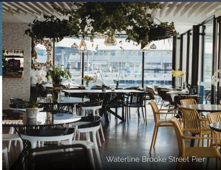
Waterline Brooke Street Pier

Waterline Berthing Deck Weddings & Functions: 250 seated 500 standing