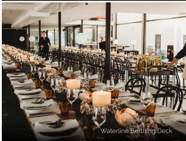
Waterline Berthing Deck

OUR OTHER WATERSIDE LOCATIONS YOU MIGHT LIKE TO CONSIDER FOR YOUR EVENT...PLEASE SEE PAGE 4